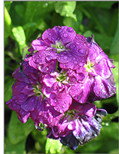
Harmony Purple Stock flowers

Harmony Purple Stock is recommended for the following landscape applications;