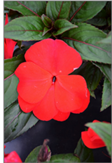
Divine Scarlet Bronze Leaf New Guinea Impatiens flowers

Divine Scarlet Bronze Leaf New Guinea Impatiens is recommended for the following landscape applications;