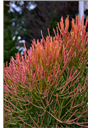
Sticks On Fire Red Pencil Tree foliage

Sticks On Fire Red Pencil Tree is recommended for the following landscape applications;