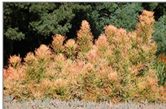
Sticks On Fire Red Pencil Tree