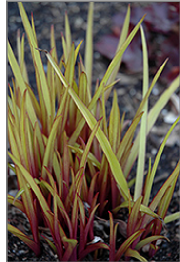
Regal Charm Spiderwort foliage

Regal Charm Spiderwort is an herbaceous perennial with an upright spreading habit of growth. Its relatively fine texture sets it apart from other garden plants with less refined foliage.