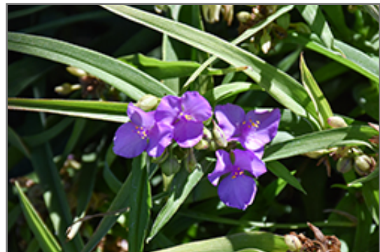
Regal Charm Spiderwort flowers