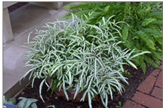
Variegated Cretan Brake Fern