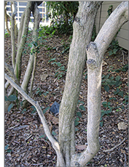
Orange Jessamine bark

Orange Jessamine is recommended for the following landscape applications;