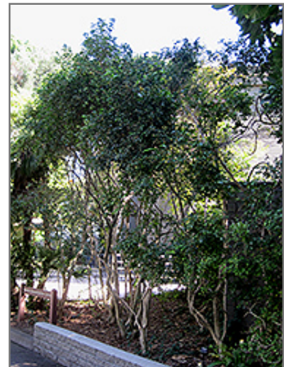
Orange Jessamine