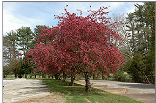
Purple Flowering Crab in bloom