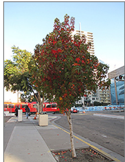
Palo Alto Sweet Gum in fall