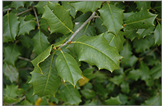
Big Red American Holly foliage

Big Red American Holly is recommended for the following landscape applications;