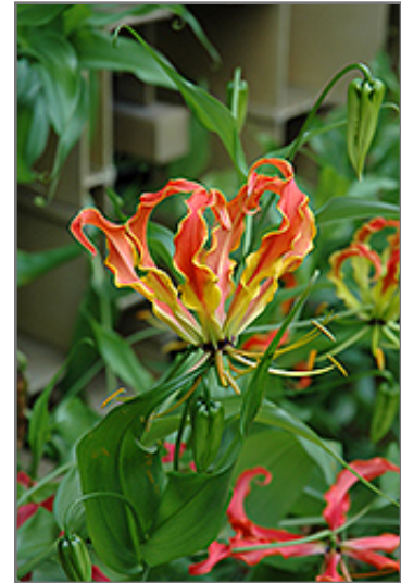
Gloriosa Lily flowers

Gloriosa Lily is recommended for the following landscape applications;