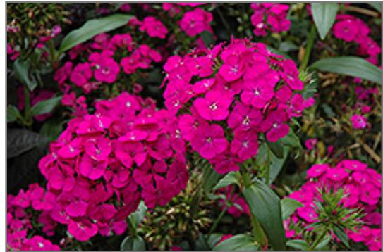
Amazon Neon Purple Pinks flowers

Amazon Neon Purple Pinks is recommended for the following landscape applications;