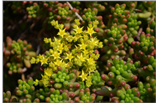
Jelly Bean Plant flowers

Jelly Bean Plant will grow to be only 5 inches tall at maturity, with a spread of 14 inches. When grown in masses or used as a bedding plant, individual plants should be spaced approximately 10 inches apart. Its foliage tends to remain low and dense right to the ground. It grows at a medium rate, and under ideal conditions can be expected to live for approximately 10 years. As an evergreen perennial, this plant will typically keep its form and foliage year-round.