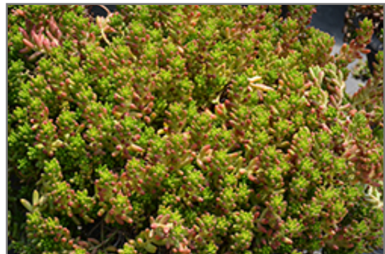
Jelly Bean Plant