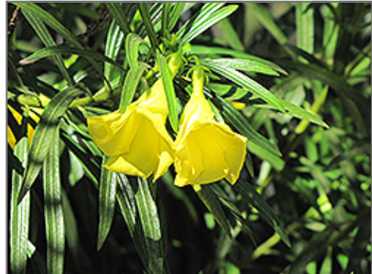
Yellow Oleander flowers

This is a high maintenance shrub that will require regular care and upkeep, and can be pruned at anytime. It is a good choice for attracting birds to your yard, but is not particularly attractive to deer who tend to leave it alone in favor of tastier treats. Gardeners should be aware of the following characteristic(s) that may warrant special consideration;