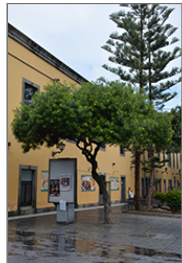
Yellow Oleander in bloom