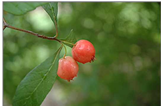
Mayhaw fruit