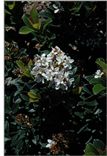
Snow White Indian Hawthorn flowers