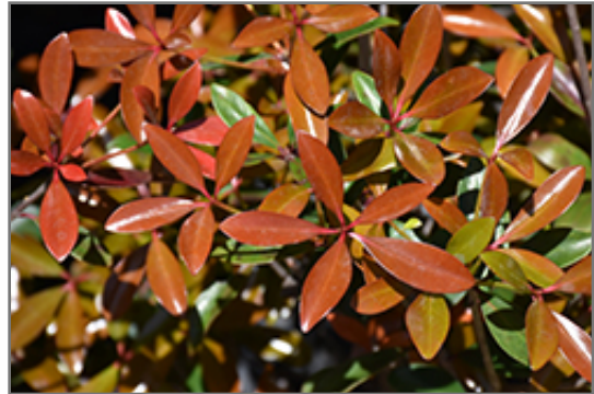
LeAnn Cleyera foliage

LeAnn Cleyera is recommended for the following landscape applications;