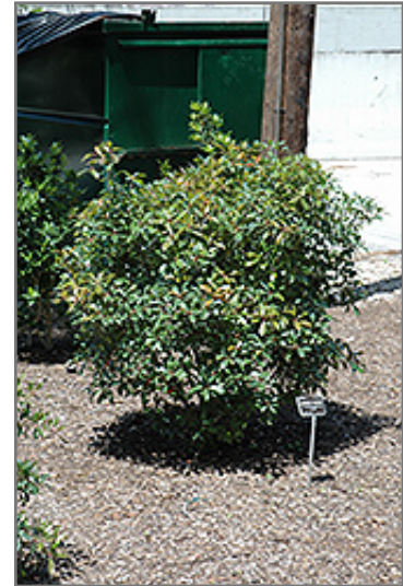
LeAnn Cleyera

LeAnn Cleyera makes a fine choice for the outdoor landscape, but it is also well-suited for use in outdoor pots and containers. Because of its height, it is often used as a 'thriller' in the 'spiller-thriller-filler' container combination; plant it near the center of the pot, surrounded by smaller plants and those that spill over the edges. It is even sizeable enough that it can be grown alone in a suitable container. Note that when grown in a container, it may not perform exactly as indicated on the tag - this is to be expected. Also note that when growing plants in outdoor containers and baskets, they may require more frequent waterings than they would in the yard or garden.