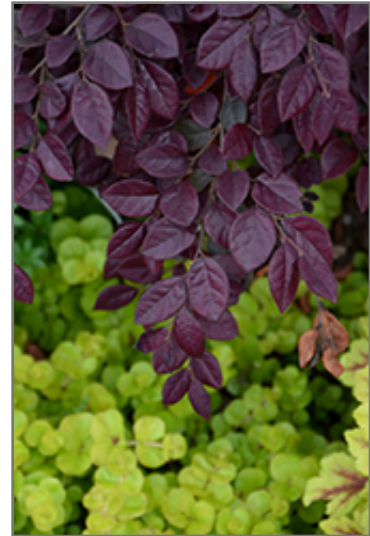
Crimson Fire Chinese Fringeflower foliage

This shrub does best in full sun to partial shade. It prefers to grow in average to moist conditions, and shouldn't be allowed to dry out. It is particular about its soil conditions, with a strong preference for rich, acidic soils. It is somewhat tolerant of urban pollution. Consider applying a thick mulch around the root zone in winter to protect it in exposed locations or colder microclimates. This is a selected variety of a species not originally from North America.