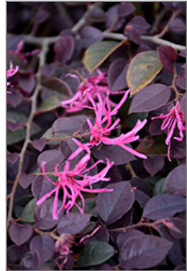
Crimson Fire Chinese Fringeflower flowers

Crimson Fire Chinese Fringeflower is recommended for the following landscape applications;