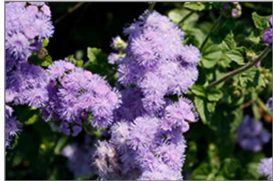
Blue Horizon Flossflower flowers

Blue Horizon Flossflower is recommended for the following landscape applications;