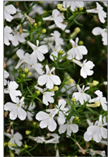
Bella Bianca Lobelia flowers