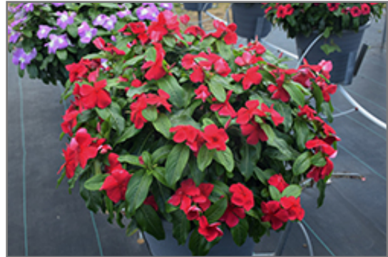
Titan Dark Red Vinca in bloom

Titan Dark Red Vinca will grow to be about 14 inches tall at maturity, with a spread of 12 inches. Its foliage tends to remain dense right to the ground, not requiring facer plants in front. Although it's not a true annual, this fast-growing plant can be expected to behave as an annual in our climate if left outdoors over the winter, usually needing replacement the following year. As such, gardeners should take into consideration that it will perform differently than it would in its native habitat.