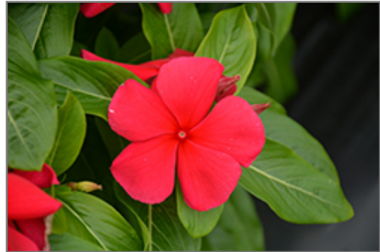
Titan Dark Red Vinca flowers

Titan Dark Red Vinca is recommended for the following landscape applications;