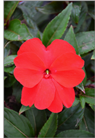
Florific Red New Guinea Impatiens flowers

Florific Red New Guinea Impatiens is recommended for the following landscape applications;