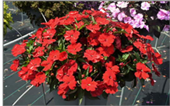
SunPatiens Compact Red New Guinea Impatiens in bloom

SunPatiens Compact Red New Guinea Impatiens is a fine choice for the garden, but it is also a good selection for planting in outdoor containers and hanging baskets. It can be used either as 'filler' or as a 'thriller' in the 'spiller-thriller-filler' container combination, depending on the height and form of the other plants used in the container planting. It is even sizeable enough that it can be grown alone in a suitable container. Note that when growing plants in outdoor containers and baskets, they may require more frequent waterings than they would in the yard or garden.