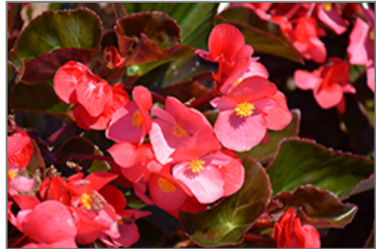
Whopper Rose Bronze Leaf Begonia flowers

This is a high maintenance plant that will require regular care and upkeep, and usually looks its best without pruning, although it will tolerate pruning. Deer don't particularly care for this plant and will usually leave it alone in favor of tastier treats. Gardeners should be aware of the following characteristic(s) that may warrant special consideration;