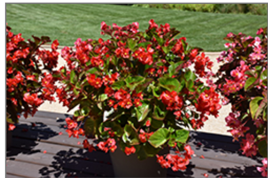
Whopper Red Green Leaf Begonia flowers