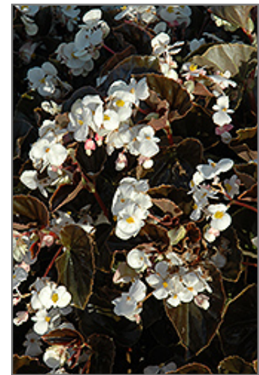
BabyWing White Bronze Leaf Begonia flowers