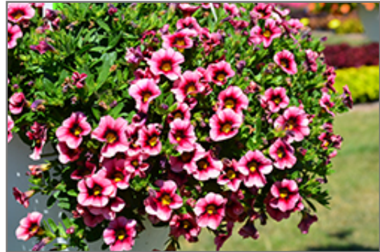
Hula Hot Pink Calibrachoa flowers

Hula Hot Pink Calibrachoa is recommended for the following landscape applications;