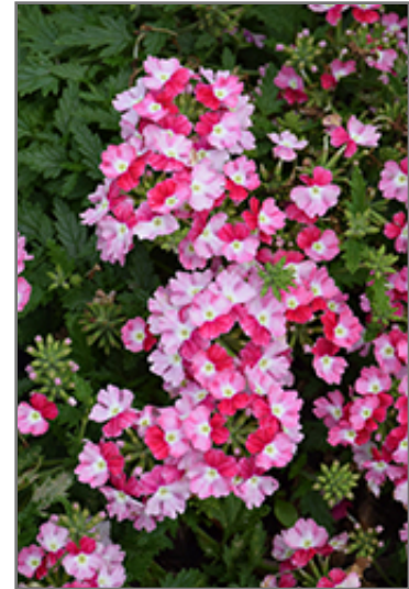
Lanai Twister Red Verbena flowers

Lanai Twister Red Verbena is recommended for the following landscape applications;