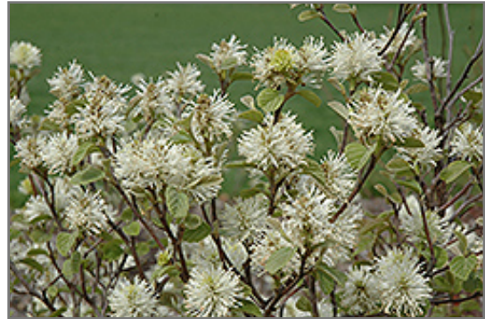
Dwarf Fothergilla flowers

This shrub does best in full sun to partial shade. It requires an evenly moist well-drained soil for optimal growth, but will die in standing water. It is not particular as to soil type, but has a definite preference for acidic soils, and is subject to chlorosis (yellowing) of the foliage in alkaline soils. It is somewhat tolerant of urban pollution. This species is native to parts of North America.