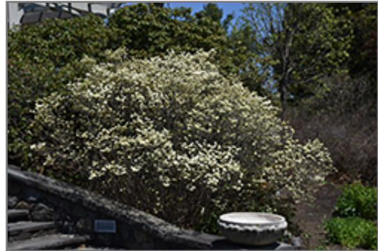
Dwarf Fothergilla in bloom

Dwarf Fothergilla is recommended for the following landscape applications;