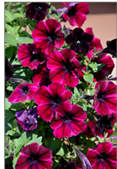
Sweetunia Johnny Flame Petunia flowers