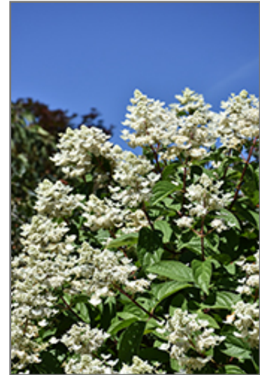
Fire And Ice Hydrangea flowers

Fire And Ice Hydrangea is recommended for the following landscape applications;