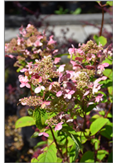
Fire And Ice Hydrangea flowers

Fire And Ice Hydrangea makes a fine choice for the outdoor landscape, but it is also well-suited for use in outdoor pots and containers. With its upright habit of growth, it is best suited for use as a 'thriller' in the 'spiller-thriller-filler' container combination; plant it near the center of the pot, surrounded by smaller plants and those that spill over the edges. It is even sizeable enough that it can be grown alone in a suitable container. Note that when grown in a container, it may not perform exactly as indicated on the tag - this is to be expected. Also note that when growing plants in outdoor containers and baskets, they may require more frequent waterings than they would in the yard or garden.