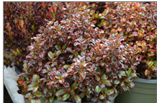
Tequila Sunrise Mirror Bush