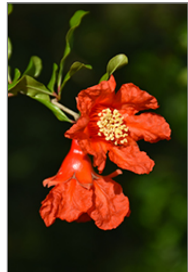
Pomegranate flowers