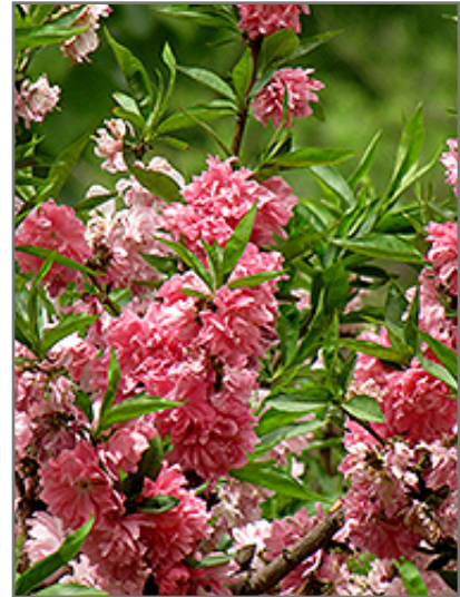
Klara Meyer Flowering Peach flowers