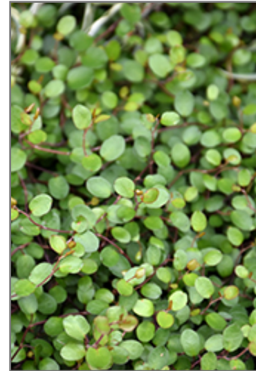
Creeping Wire Vine foliage