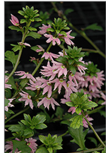
Bombay Pink Fan Flower flowers