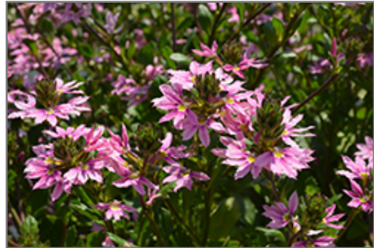
Bombay Pink Fan Flower flowers

Bombay Pink Fan Flower is recommended for the following landscape applications;