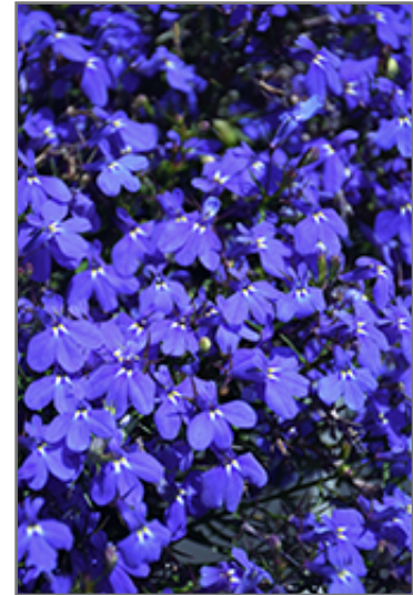
Techno Blue Lobelia flowers

Techno Blue Lobelia is recommended for the following landscape applications;