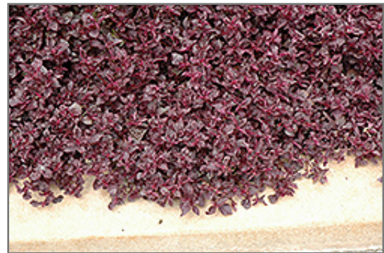
Purple Lady Blood Leaf