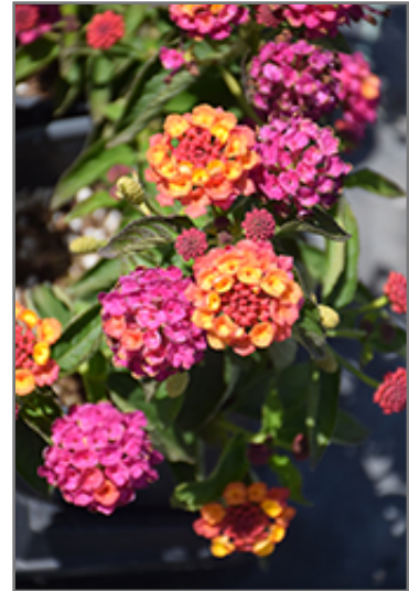
Lucky Sunrise Rose Lantana flowers

Lucky Sunrise Rose Lantana is recommended for the following landscape applications;