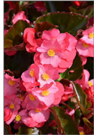
Big Rose Bronze Leaf Begonia flowers

Big Rose Bronze Leaf Begonia is recommended for the following landscape applications;