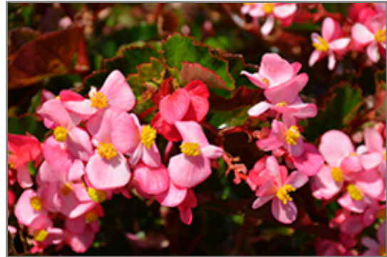
BabyWing Pink Begonia flowers

This is a high maintenance plant that will require regular care and upkeep, and usually looks its best without pruning, although it will tolerate pruning. Deer don't particularly care for this plant and will usually leave it alone in favor of tastier treats. Gardeners should be aware of the following characteristic(s) that may warrant special consideration;