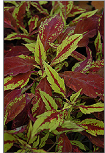
Pineapple Coleus foliage