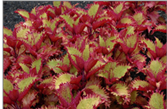
Henna Coleus foliage