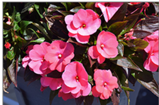
Sonic Pink New Guinea Impatiens flowers