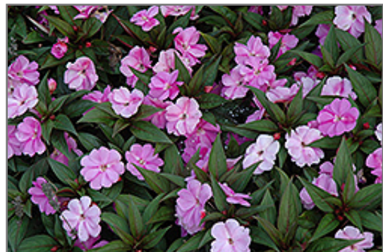
Divine Lavender New Guinea Impatiens flowers