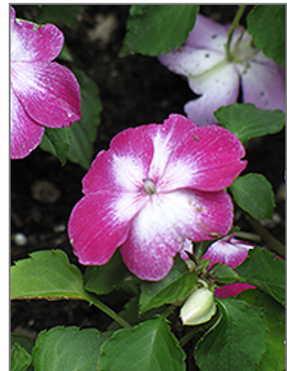
Stardust Violet Impatiens flowers