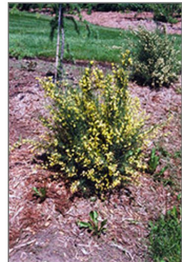
Scotch Broom in bloom