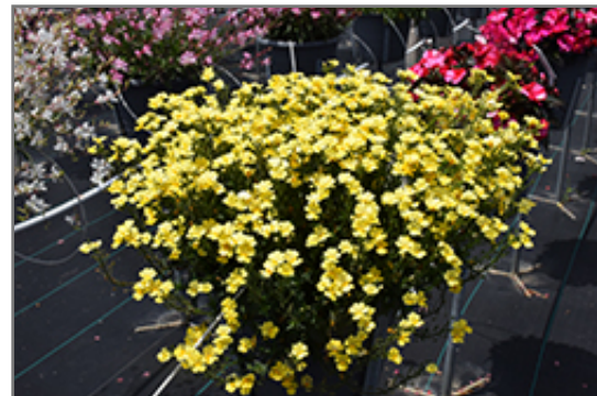
Sunsatia Lemon Nemesia in bloom