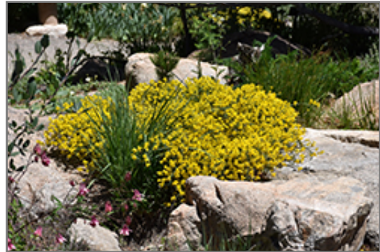
Vancouver Gold Woadwaxen in bloom