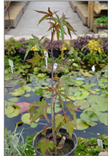
Scarlet Rose Mallow

Scarlet Rose Mallow is a fine choice for the water garden, but it is also a good selection for planting in outdoor pots and containers. With its upright habit of growth, it is best suited for use as a 'thriller' in the 'spiller-thriller-filler' container combination; plant it near the center of the pot, surrounded by smaller plants and those that spill over the edges. It is even sizeable enough that it can be grown alone in a suitable container. Note that when grown in outdoor pots and containers, aquatic plants like this one will require a special growing environment that meets their requirement for consistent moisture.