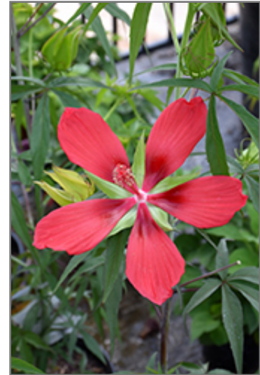
Scarlet Rose Mallow flowers

Scarlet Rose Mallow is ideally suited for growing in a pond, water garden or patio water container, and is recommended for the following landscape applications;