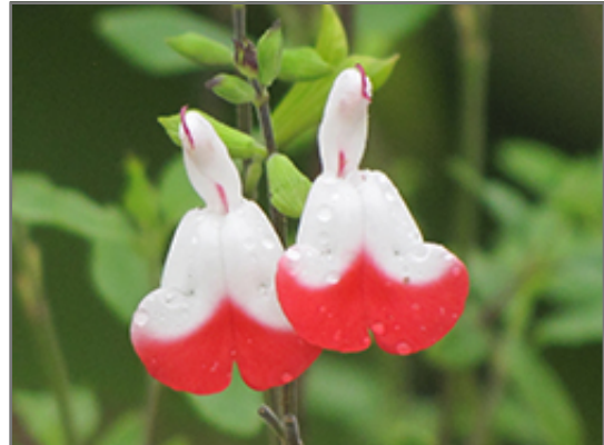
Hot Lips Sage flowers

Hot Lips Sage is an herbaceous evergreen perennial with an upright spreading habit of growth. Its relatively fine texture sets it apart from other garden plants with less refined foliage.