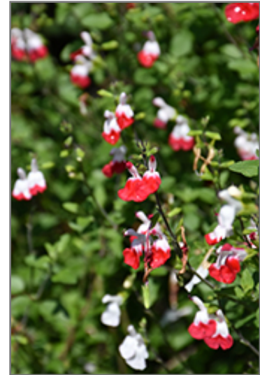
Hot Lips Sage flowers

Hot Lips Sage is a fine choice for the garden, but it is also a good selection for planting in outdoor pots and containers. With its upright habit of growth, it is best suited for use as a 'thriller' in the 'spiller-thriller-filler' container combination; plant it near the center of the pot, surrounded by smaller plants and those that spill over the edges. It is even sizeable enough that it can be grown alone in a suitable container. Note that when growing plants in outdoor containers and baskets, they may require more frequent waterings than they would in the yard or garden.